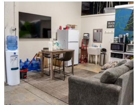
1ST LEVEL - UNIT C