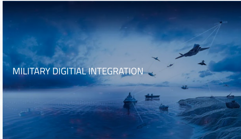
MILITARY DIGITAL INTEGRATION