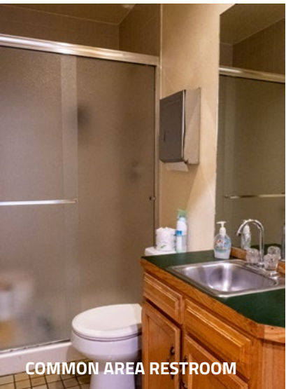
COMMON AREA RESTROOM