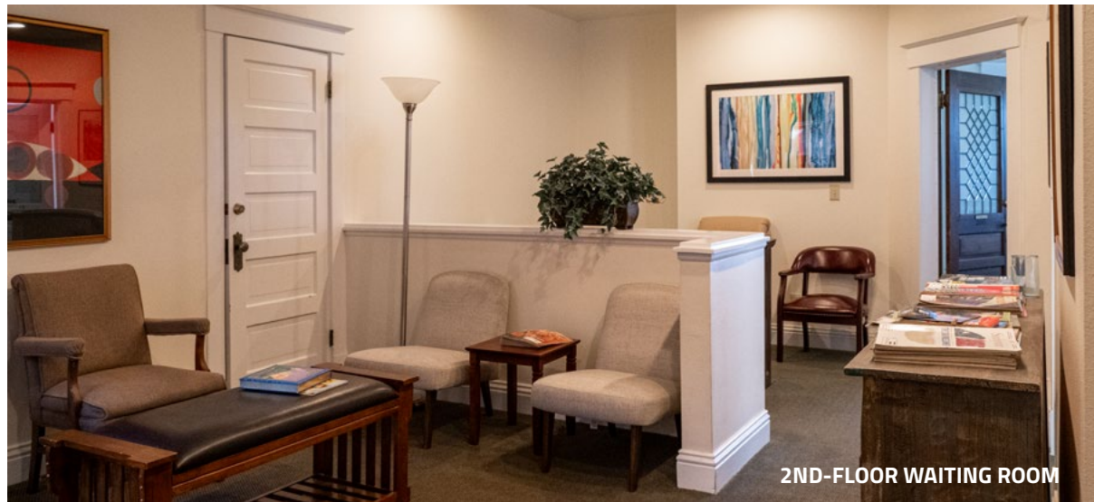
2ND-FLOOR WAITING ROOM