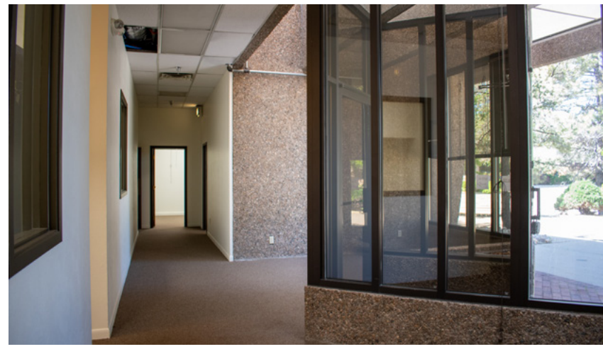
All information furnished regarding this property is obtained from sources deemed reliable. Dean Callan & Company, Inc. makes no representation, guarantee or warranty, expressed or implied, as to the accuracy thereof.