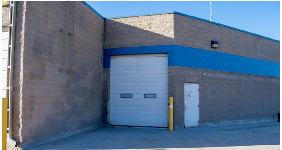
SUITE 101: 1,879 SF