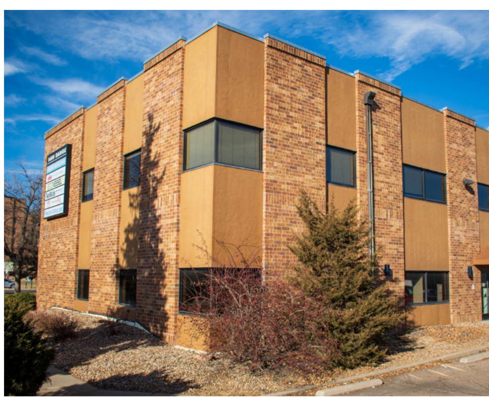
All information furnished regarding this property is obtained from sources deemed reliable. Dean Callan & Company, Inc. makes no representation, guarantee or warranty, expressed or implied, as to the accuracy thereof.

1510 28th Street, Suite 200 Boulder, Colorado 80303 303.449.1420 | www.deancallan.com