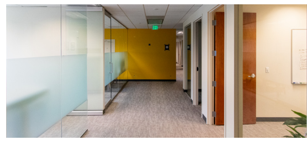
All information furnished regarding this property is obtained from sources deemed reliable. Dean Callan & Company, Inc. makes no representation, guarantee or warranty, expressed or implied, as to the accuracy thereof.